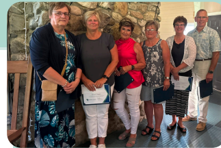
35, 40 and 45 Years